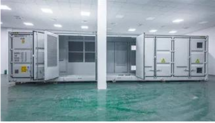
botswana solar energy storage cabinetized automated type

The World Bank has approved funding for Botswana's first grid-side battery energy storage system (BESS), which will have an output of 50MW and a storage capacity of 200MWh.