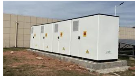
Supercapacitor module manufacturer in Vanuatu

VINATech - is a world leader in the manufacturing of supercapacitors, providing high-quality energy-saving devices, including but not limited to Super Capacitors and Lithium-Ion