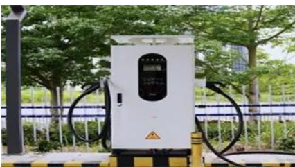
304 Stainless Steel Energy Cabinet ,Outdoor Waterproof Enclosure

Widely used in telecommunications, power distribution, solar energy, and traffic control sectors, this energy cabinet supports integration of various electrical devices with easy maintenance and upgrades.