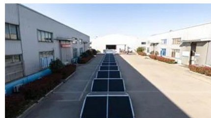
Best Foldable Solar Container for Off-Grid Power , Sunmaygo

Solar photovoltaic (PV) technology has emerged as a key renewable energy solution, yet its widespread adoption faces several technical and economic challenges.