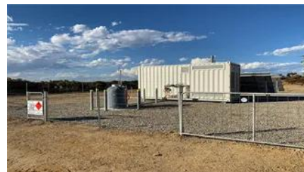
215KWh Fold-Out Solar Container Battery System (40ft)

You probably tried to import a new input system package for multiple input devices compatibility. These type of errors are due to conflict between old and new input system packages