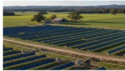
Outdoor Energy Storage System Cabinets , EPC Energy

EPC Energy serves the utility and developer market with multi-MWh solutions featuring 40? container or skid-based designs. These