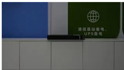
Cost of 100kW energy storage cabinet for middle eastern base stations

Wondering how much a Juba large-scale energy storage system costs? This comprehensive guide breaks down pricing factors, industry trends, and smart purchasing strategies for commercial users.