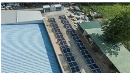
JinkoSolar to Install Energy Storage Systems at Athens Airport

JinkoSolar's advanced energy storage technology is expected to improve the airport's energy resilience and reduce operational costs. The systems will store excess energy generated