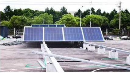
east africa photovoltaic energy storage cabinet 20mwh

The project is furnished with a 5.308 MWh energy storage system comprising 2 2.654 MWh battery energy storage containers and 1 35 kV/2.5 MVA energy storage conversion boost system.