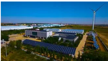
Prefabricated Box-Type Substation , Best Design

Explore our prefabricated box-type substation series-compact, modular, and ideal for efficient power transformation and distribution.